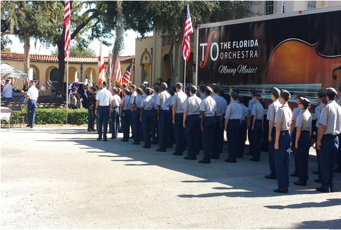
Veteran's Day Ceremony at Bay Pines.