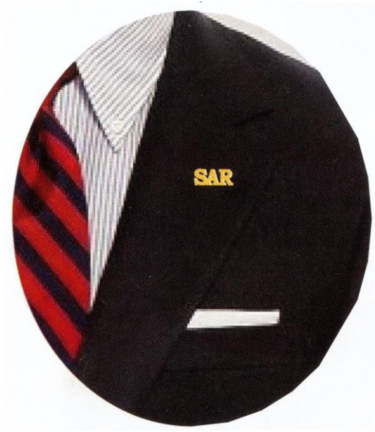
SAR Lapel Pin