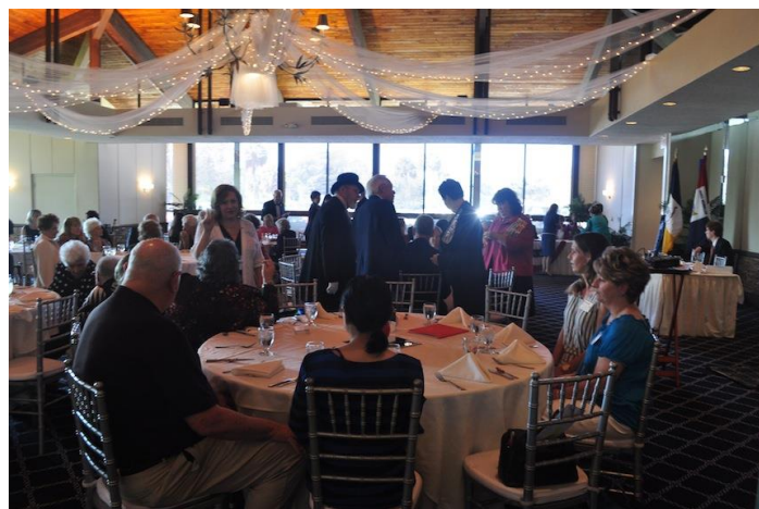
SAR hosts and DAR guests at Presidents Day Luncheon