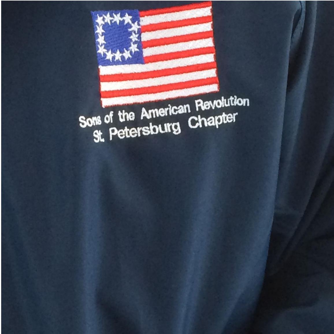
Embroidered logo of new chapter jacket