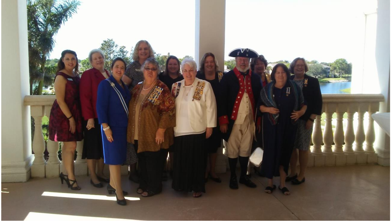
Compatriot Chestnut with Boca Ciega DAR members