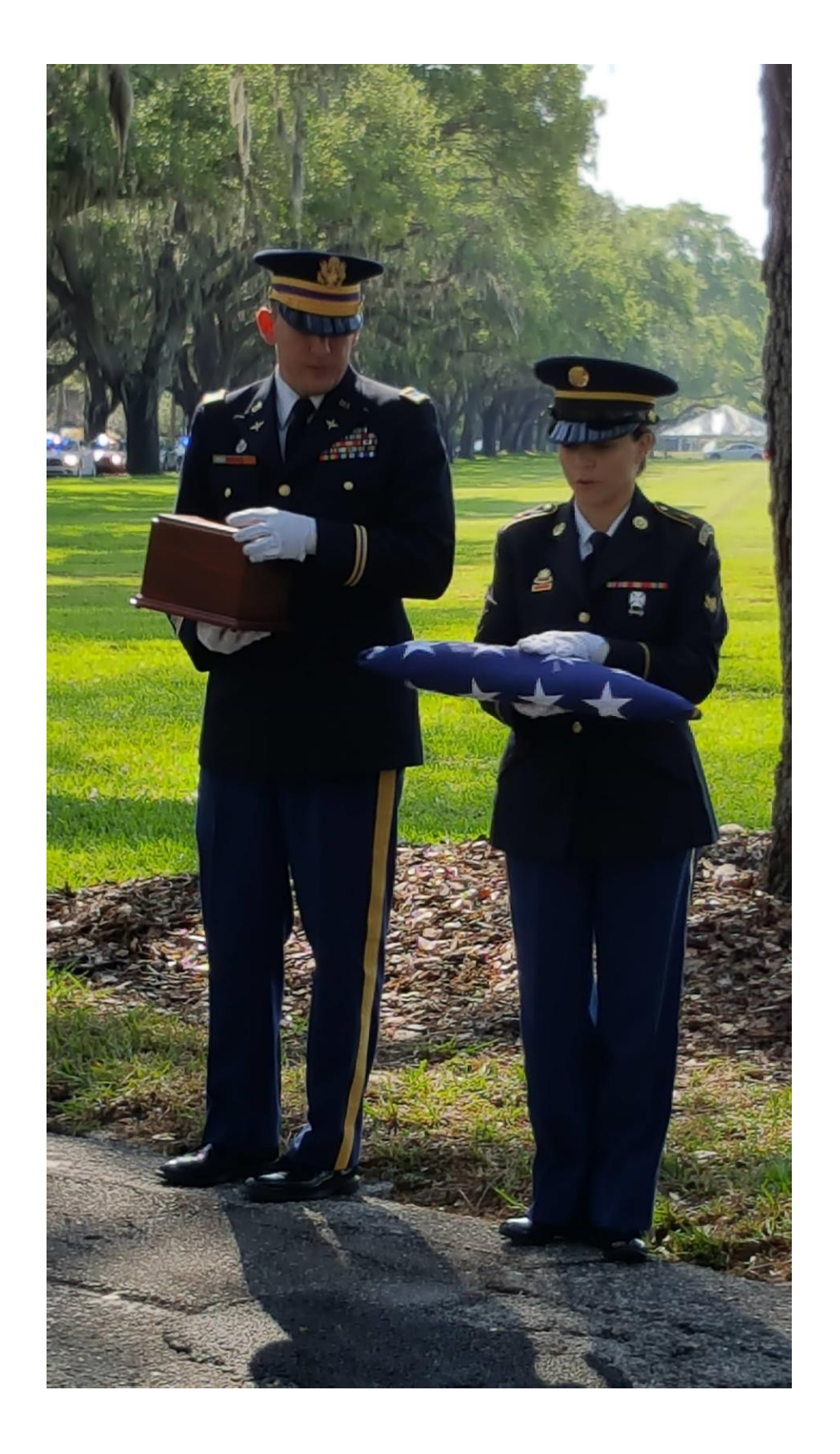
Honor guard at Mumford memorial services