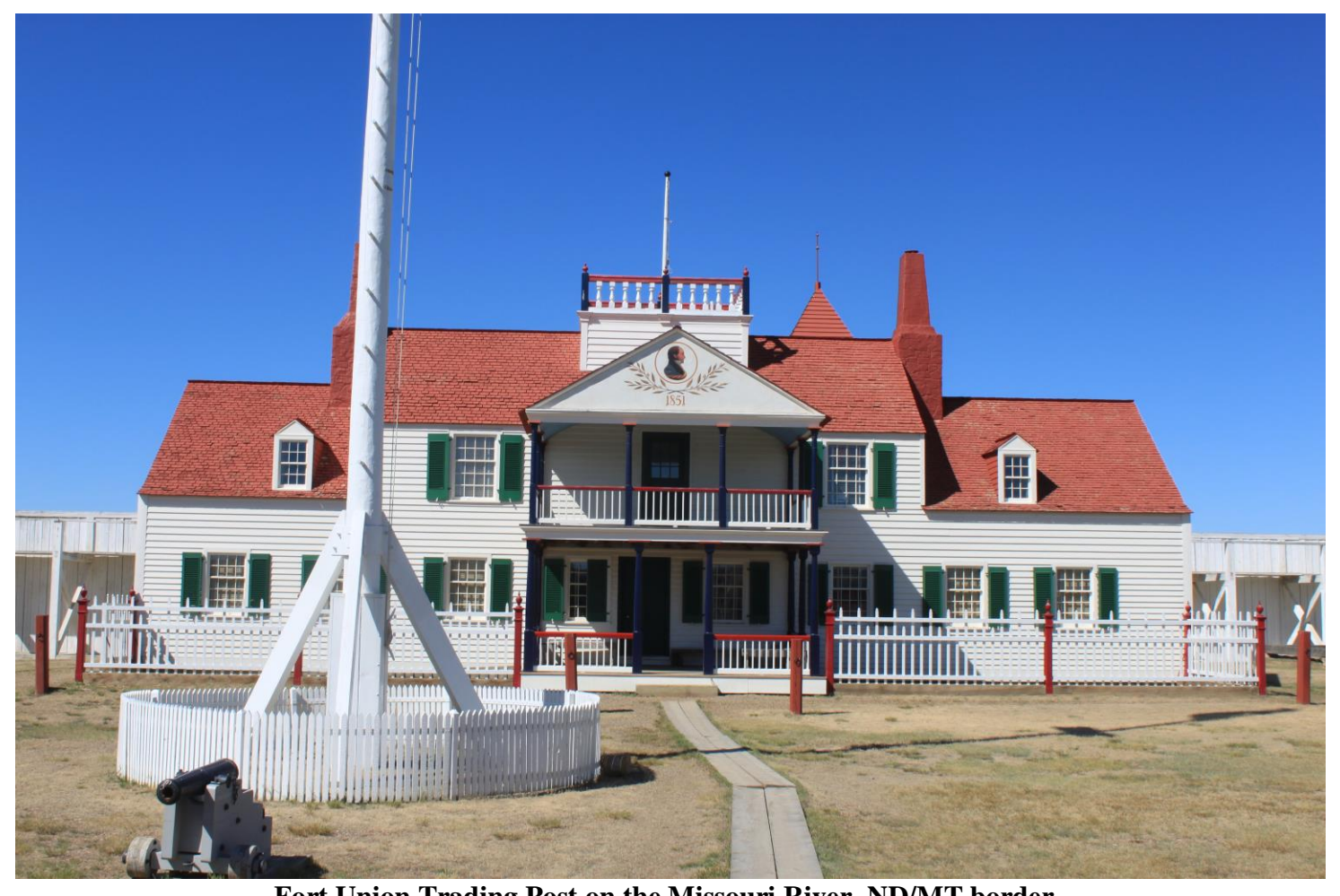
Fort Union Trading Post on the Missouri River, ND/MT border This was the main fur trading post on the upper Missouri River from the 1820s – 1860s