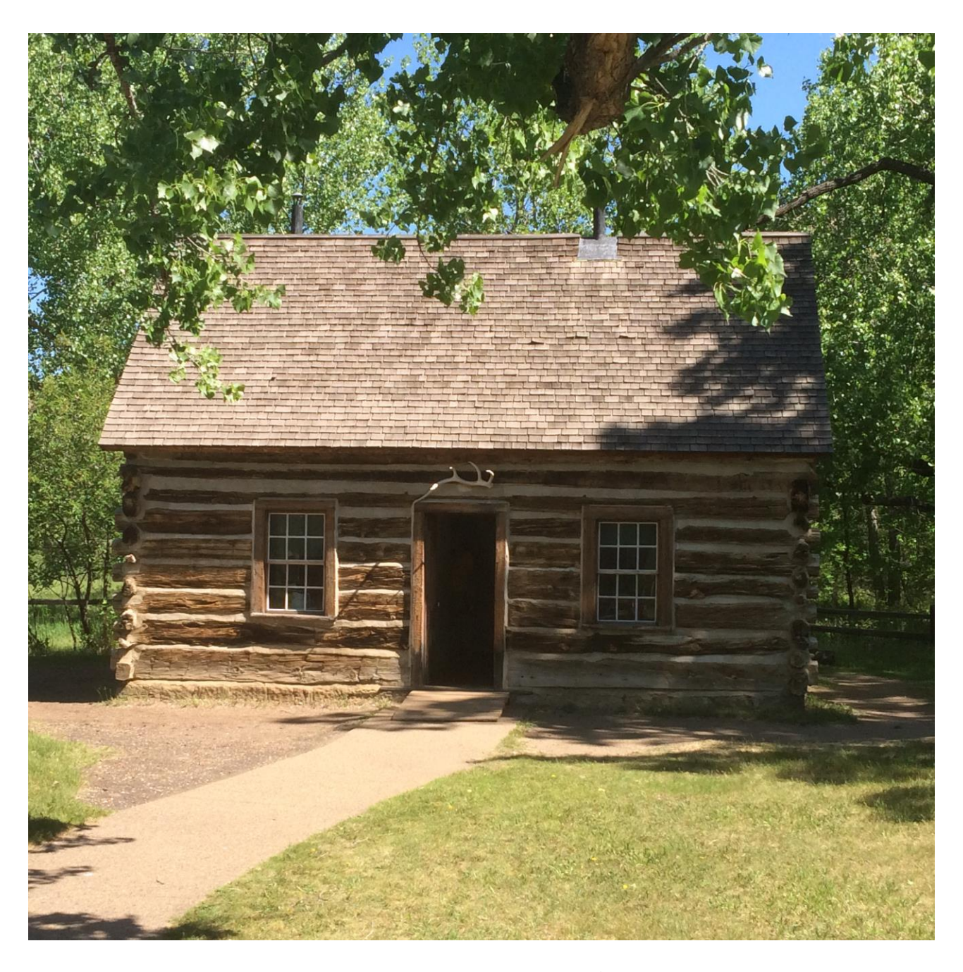
Teddy's Cabin at Theodore Roosevelt National Park, ND