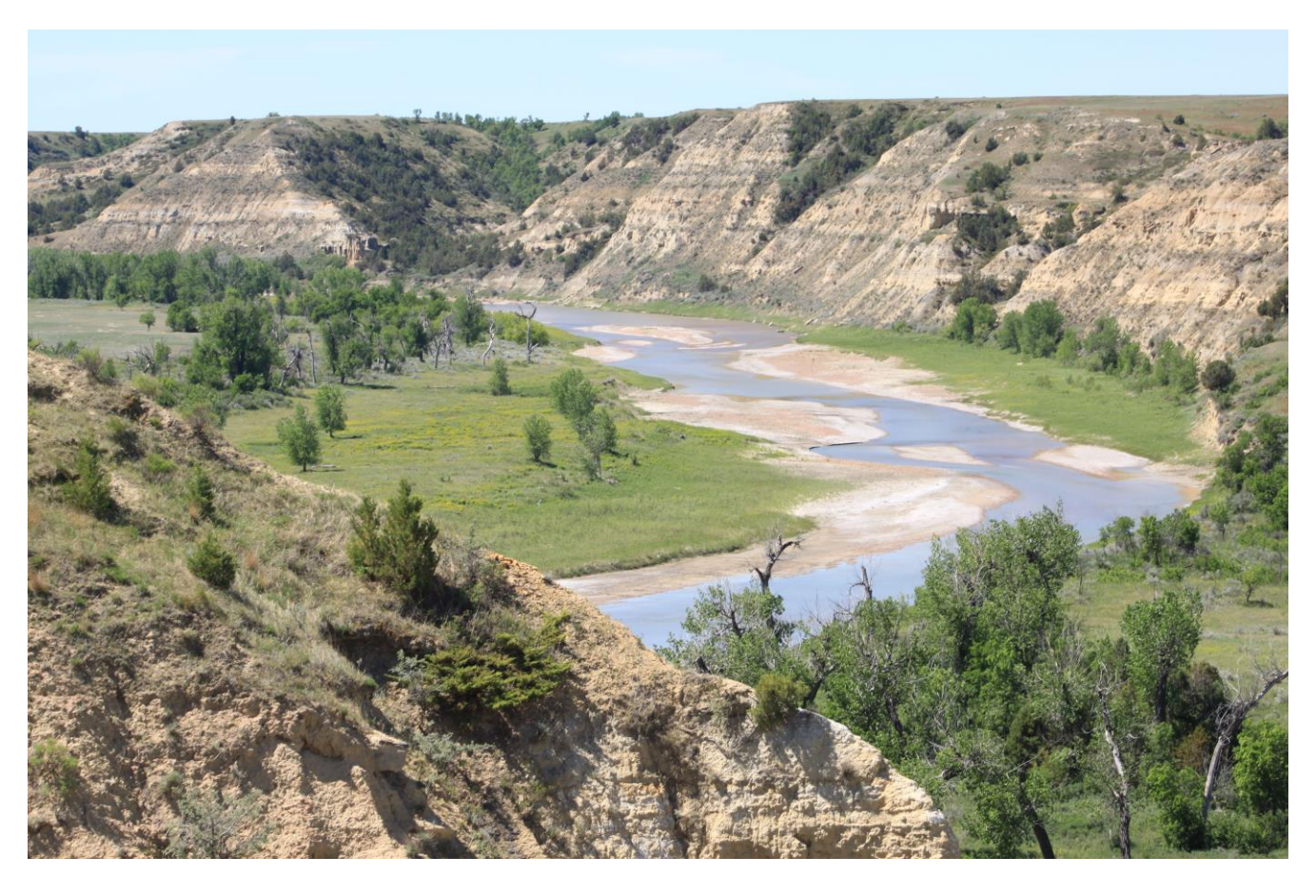
Little Missouri River, Theodore Roosevelt National Park