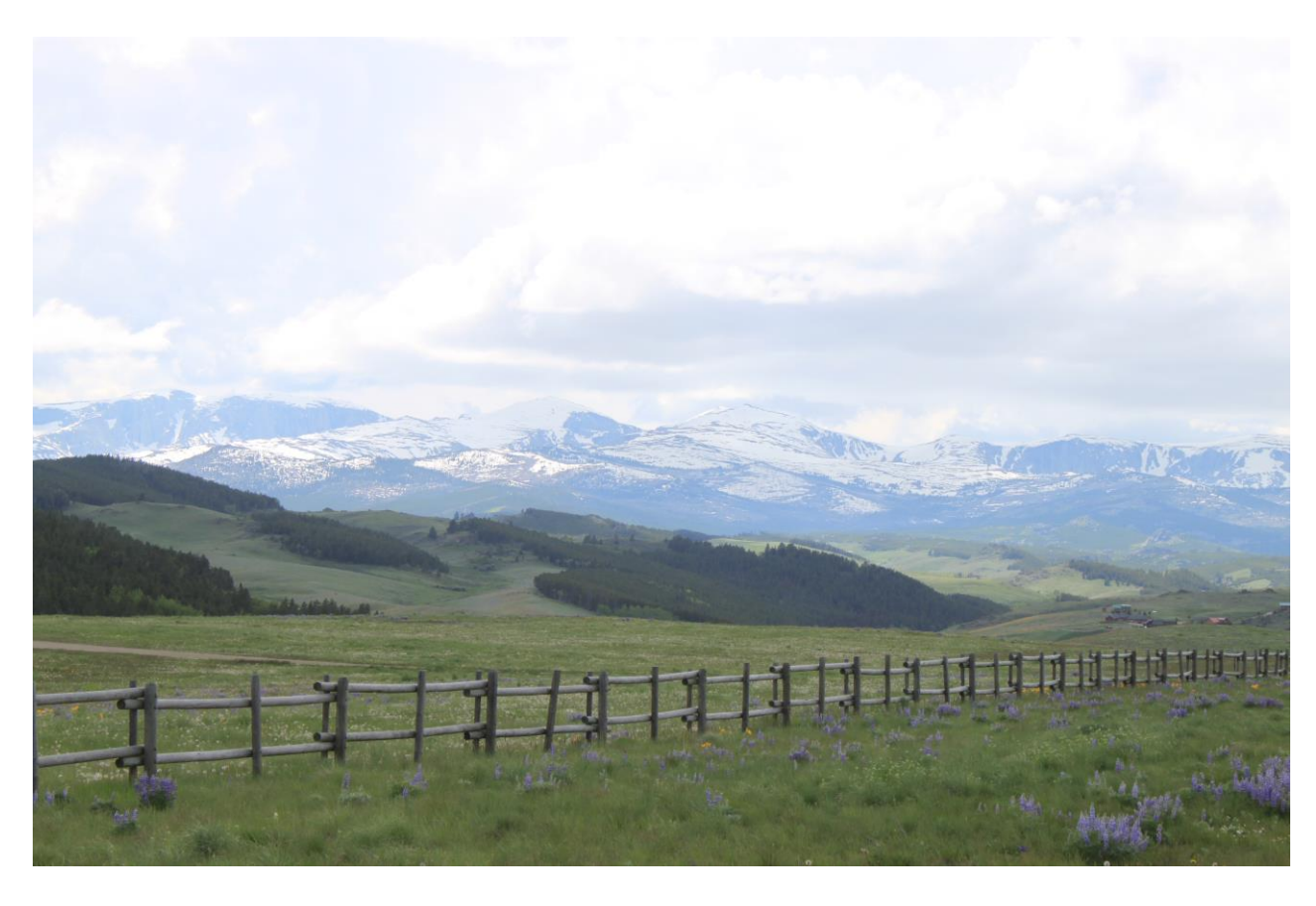
Cloud Peak near Buffalo, WY - - big sky country!