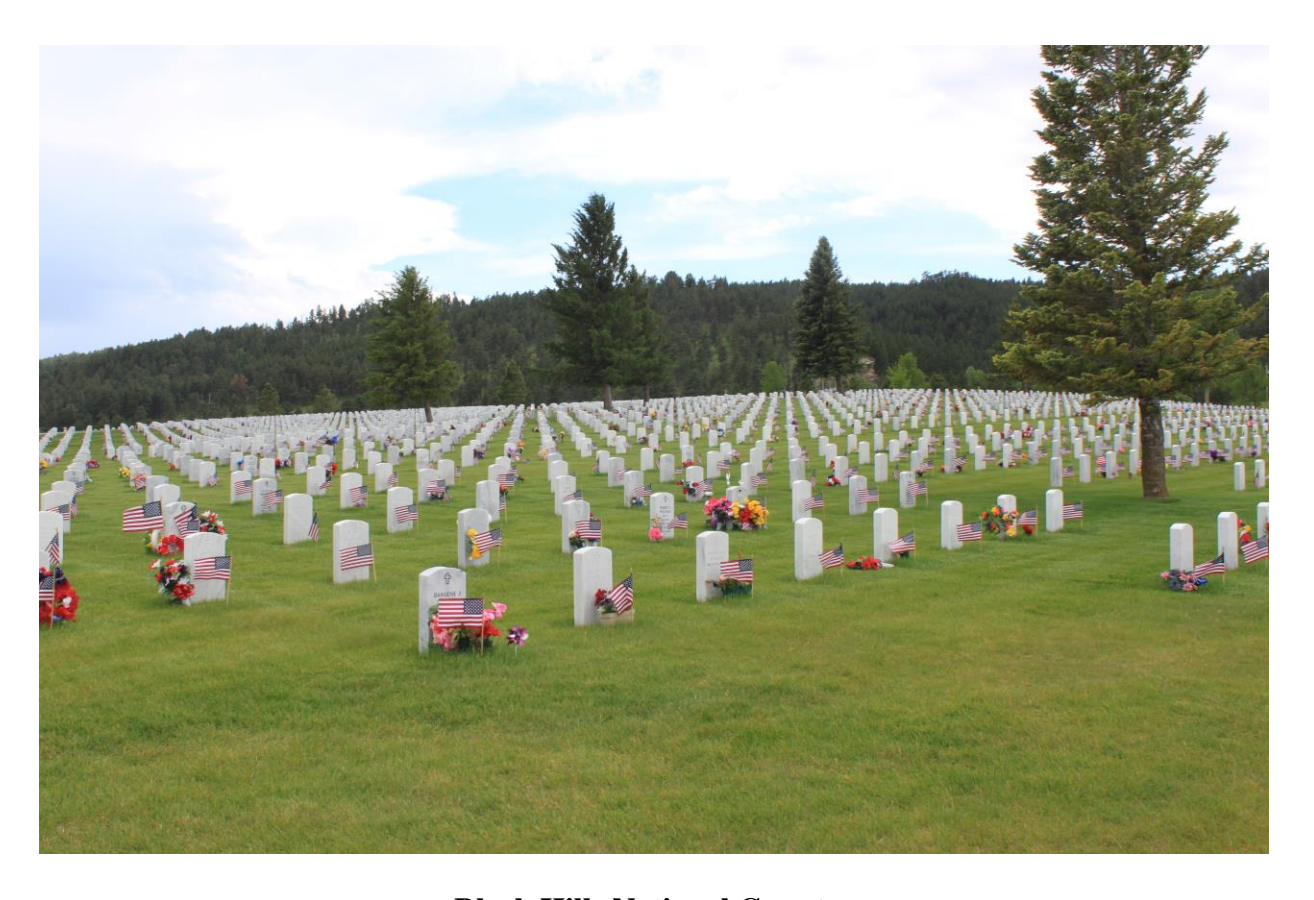
Black Hills National Cemetery

Many of the "towns" on the map are merely a wide spot in the road, often without a store or a gas station, and the next "town" may be 40 or 50 miles in any direction. The pioneer spirit of our founding fathers is alive and well out west!