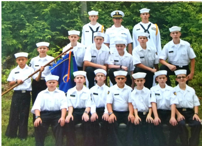
My first division of recruits circa 2008. Still friends with most of them!