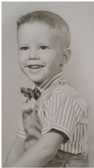
Looking Dapper in my bow tie!