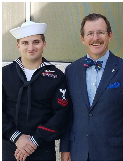
2 Macs in Bows! One is on shore leave.