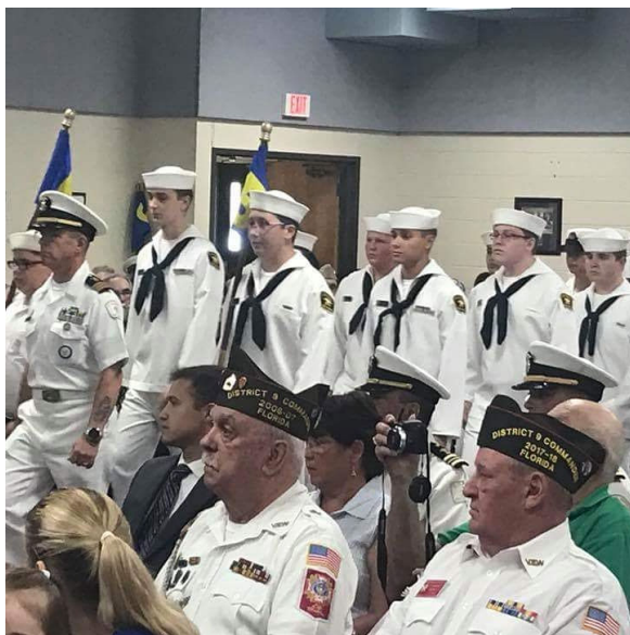
Taking Command of Suncoast