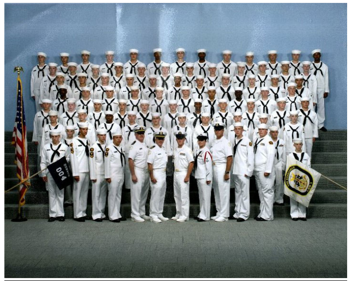
Commanding Honor Division 004 in 2010 at Great Lakes.