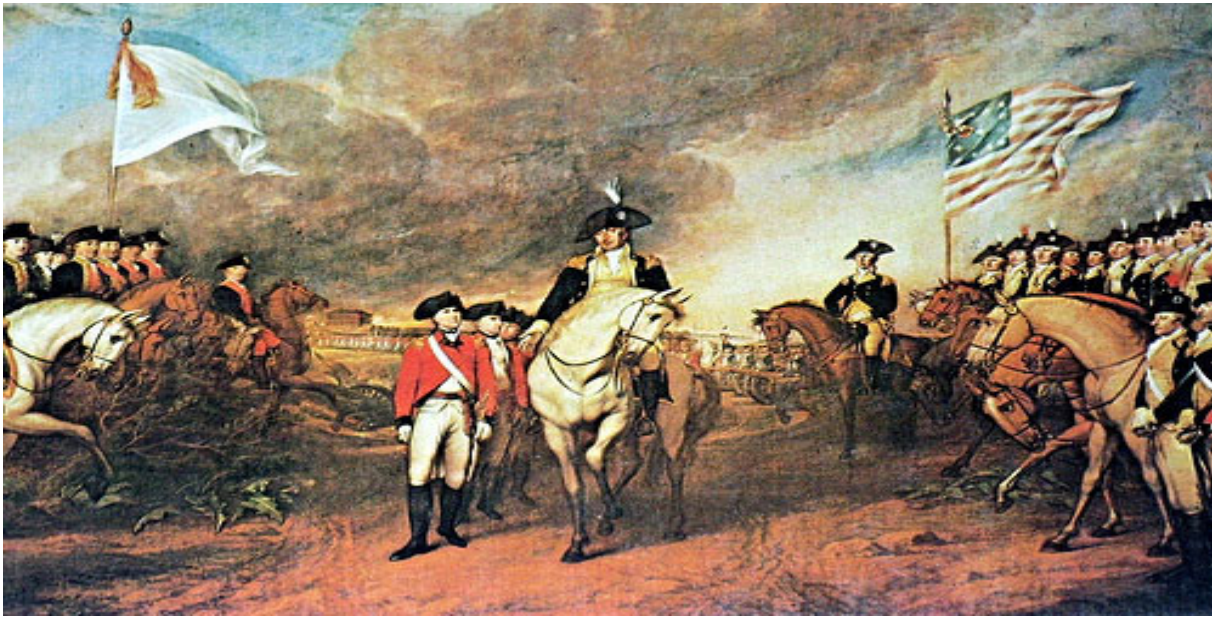
'Surrender of Lord Cornwallis' by John Trumbull depicting the British surrender which ended the American Revolutionary War